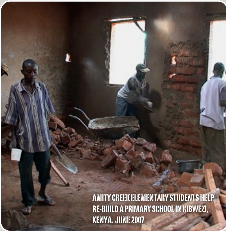
AMITY CREEK ELEMENTARY STUDENTS HELP RE-BUILD A PRIMARY SCHOOL IN KIBWEZI, KENYA. JUNE 2007