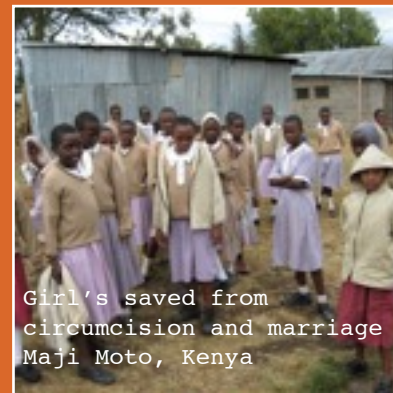
Girl's saved from circumcision and marriage Maji Moto, Kenya