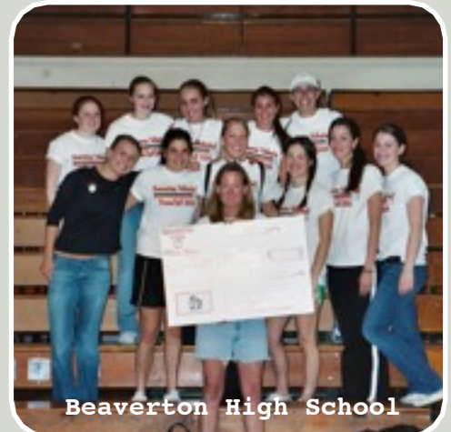
Beaverton High School